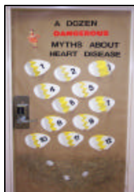
L & D